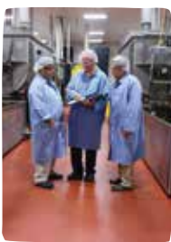
Meat, Poultry & Seafood