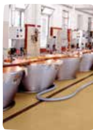
Dairy & Cheese Processing