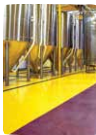
Bottling Plants & Brewhouses