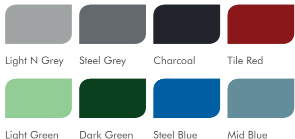
Light N Grey | Steel Grey | Charcoal | Tile Red

*Assume concrete or substrate is a minimum of 25 N/mm 2 .