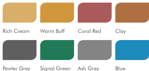
Pewter Grey Signal Green Ash Grey Blue