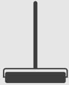
10-12mm Nap Roller *Do not use Microfibre

The following equipment is recommended for this application.