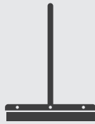
Serrated and Normal Squeegee